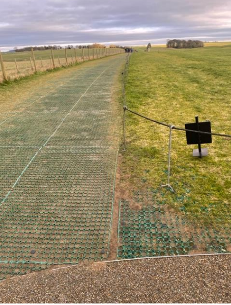
Portapath around part of stones