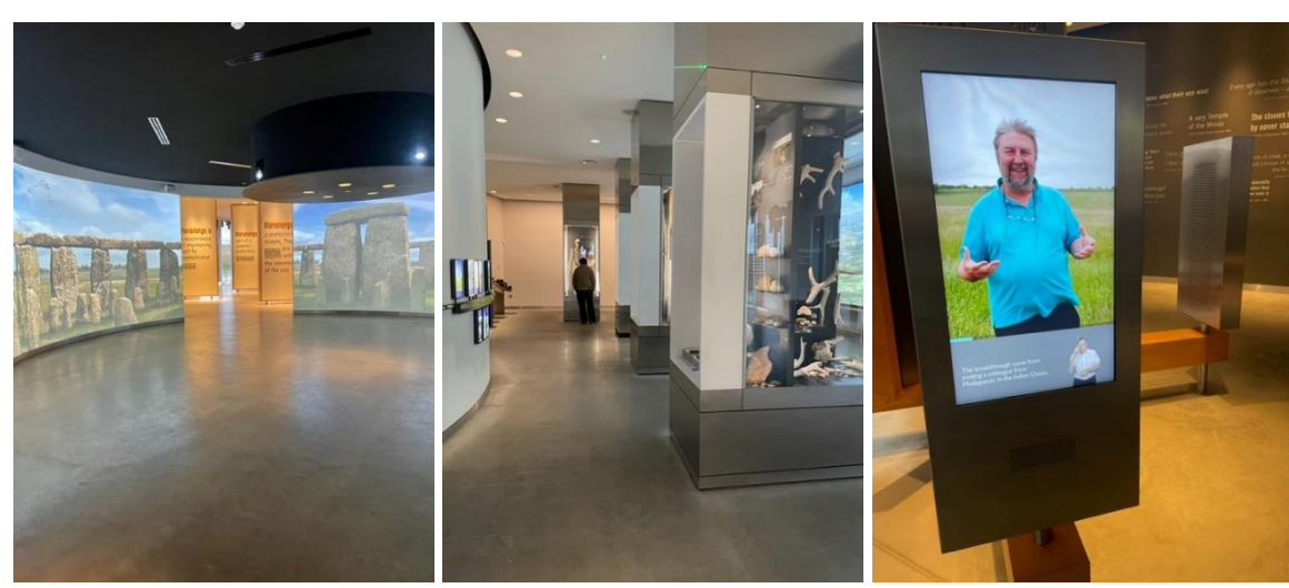
360' experience in exhibition display