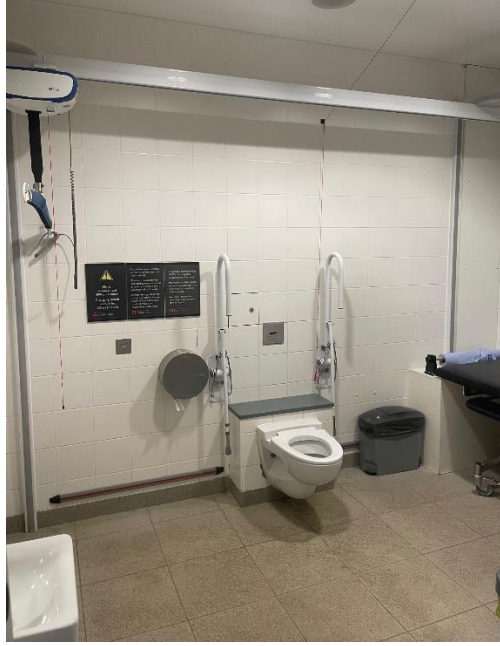
Accessible toilet at Visitor Centre