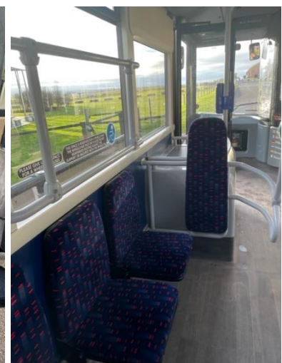
Drop off point at monument space in bus