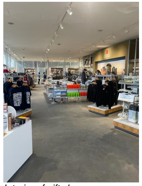
Interior of gift shop