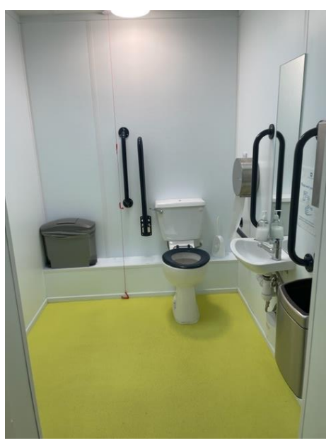
Accessible toilet in the Education Room