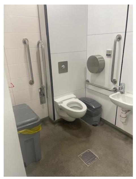
Accessible toilet at Group Admissions