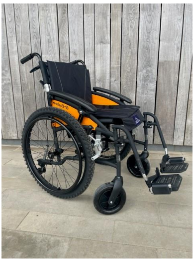
All terrain wheelchair