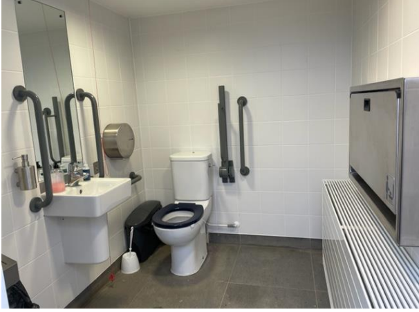
Accessible toilet at Monument site

3 unisex toilets and an accessible toilet are available for emergency use upon request. A member of staff can direct visitors if these toilets are needed.