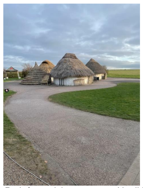
Path from visitor centre to Neolithic houses